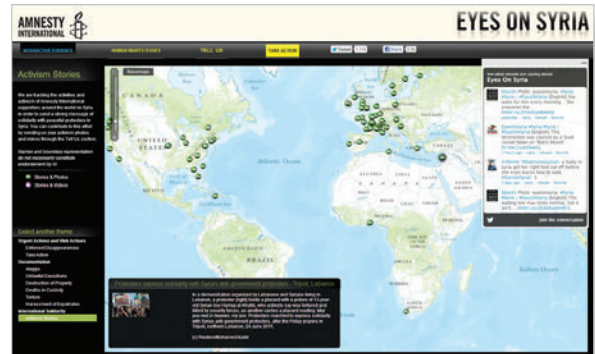
Amnesty International - Eyes on Syria eyesonsyria.org

To provide the global community with new ways of visualizing demographic and health data, Blue Raster collaborated with USAID and ICF International to develop the new STATcompiler. This application supports The DHS Program project, which assists in the collection and dissemination of global health data. Users can create maps, graphs, and charts to compare survey results over time, and customize visuals with data from 70 countries and thousands of health indicators and demographic characteristics, including age, education, and wealth. STATcompiler will increase the use of current information in policy decisions and allow for accurate program monitoring.