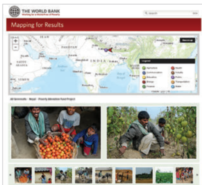
The World Bank – Georezults maps.worldbank.org/content/georezults

Eyes on Syria offers a comprehensive picture of the situation in and outside Syria using geolocated photography and video evidence with eyewitness testimonies as well as activist campaign materials. This application tracks human rights concerns within Syria, the harassment of pro-reform Syrians abroad, and activism of Amnesty International supporters around the world.