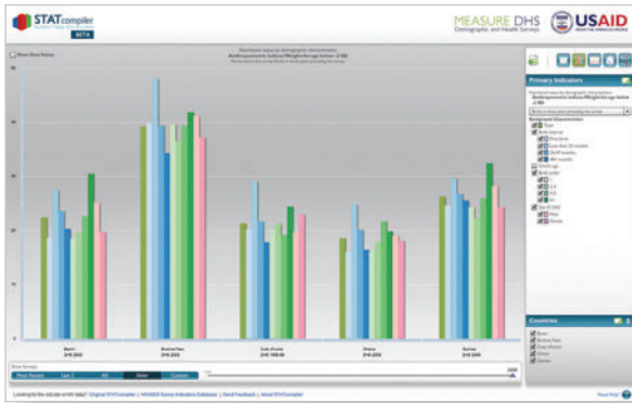
USAID - The DHS Program STATcompiler statcompiler.com

To provide the global community with new ways of visualizing demographic and health data, Blue Raster collaborated with USAID and ICF International to develop the new STATcompiler. This application supports The DHS Program project, which assists in the collection and dissemination of global health data. Users can create maps, graphs, and charts to compare survey results over time, and customize visuals with data from 70 countries and thousands of health indicators and demographic characteristics, including age, education, and wealth. STATcompiler will increase the use of current information in policy decisions and allow for accurate program monitoring.